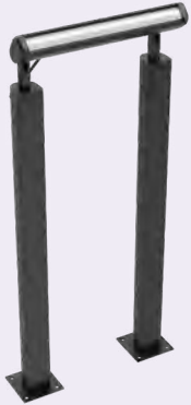
Stanchion Mount Splice Access SMSA