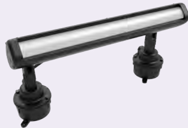
Junction Box JB4750L