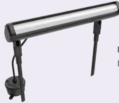
Mounting Spike MS12