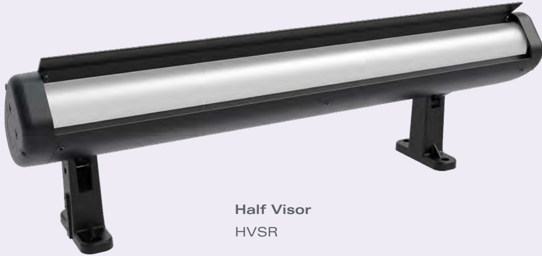
Half Visor HVSR