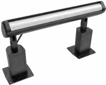
Pedestal Extended Arm PSSA